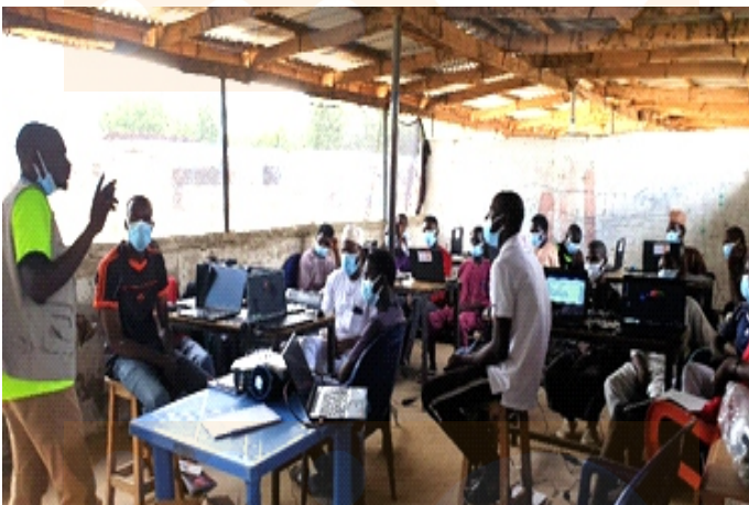
Male participants receiving training on the functions of the computer mouse during a digital training.