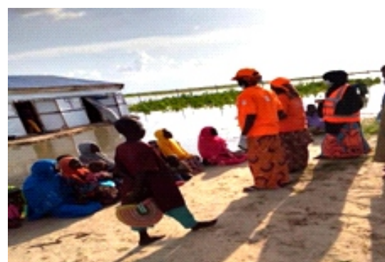
Cross section of UNFPA staff during flood intervention in Flatari, Rann, 1000 camp and kuya Community in Monguno, Kala/Balge and Dikwa LGA.