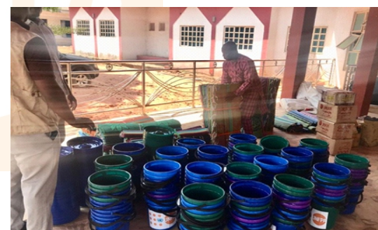
Onloading and sorting of dignity kits to the affected flooded communities in Ogbaru LG, Anambra State.