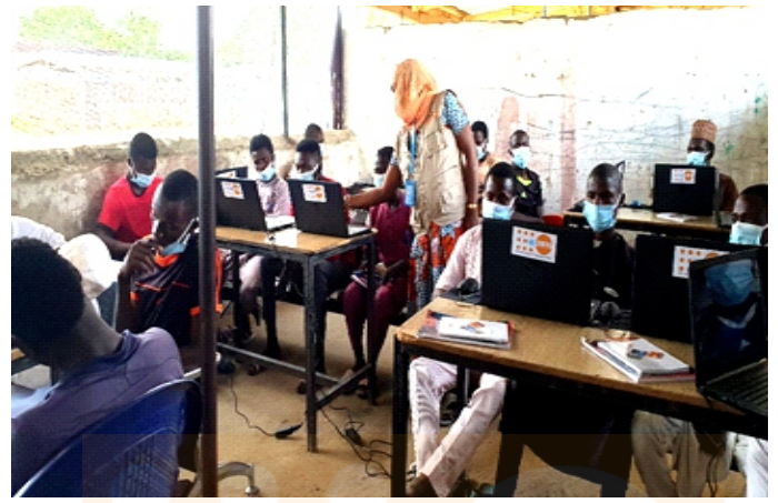
Providing opportunities to IDP adolescent boys and girls to acquire skills on ICT to as a means of resilience building through digitalization , at IDP Camps.