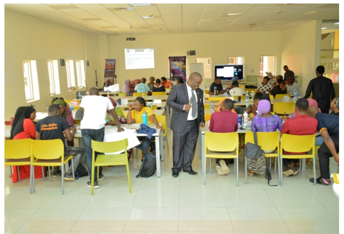
Participants from the GBVIE Cohort 6 course during a group work discussion on Community Engagement guided by facilitators