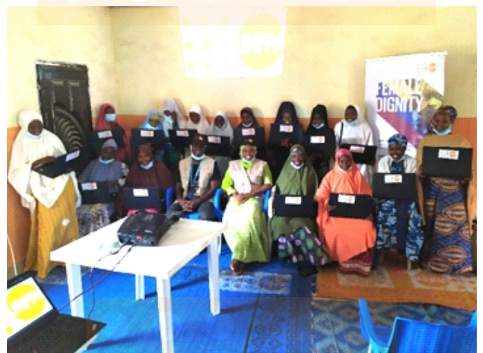
Female participants of digital literacy training 2.0 at Madinatu IDPs Camp, Maiduguri