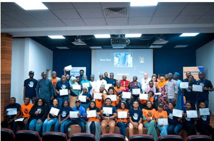
Cross section of graduating participants from the GBVIE Cohort 6 Course in a group photograph with high level guests from Government, Civil society including faculty members from the American University of Nigeria and course facilitators.z