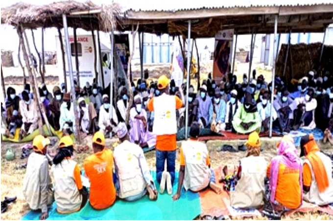
Engagement with gate keepers/community leaders on the protection needs of women and girls and remove on their role in ensuring SRH rights for everyone.