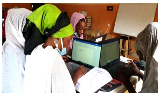
Digital literacy students during a typing skills exercise.