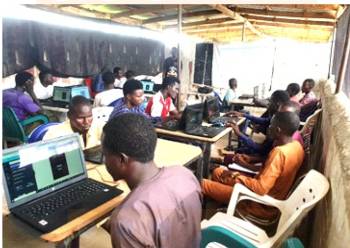
Session on Graphics design by male participants at Muna IDPs camp, Maiduguri.