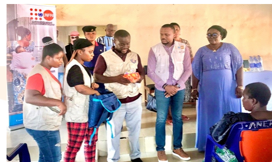
Explanation of each item inside the dignity kit bag to the women at Anambra West LG before distribution with the Honorable Commissioner of Women Affairs and Social Welfare, Anambra State.

UNFPA is currently working with Anambra State Emergency Management Agency (ANSEMA), State Ministry of Health, State Ministry of Women and Children Affairs and the local coordinating group for all partners supporting the response led by IOM. UNFPA has responded to the flood incident with the following relief materials and technical guidance to support flood affected communities in the State