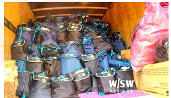
A snapshot of dignity kits, menstrual hygiene kits, male and female condoms that were handed over to Anambra State Government by UNFPA MDSO.