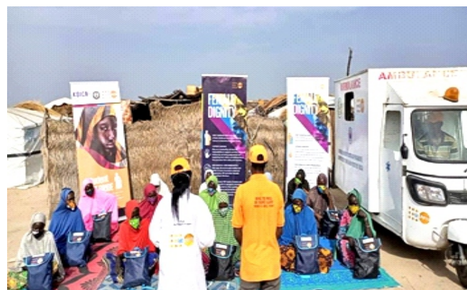
UNFPA team engaging IDP women and girls on GBV and SRH key messages including cholera prevention and control (IPC) messages in the context of the flooding and cholera outbreak.

The Region also has a very high Maternal Mortality Rate of 1,546 per 100,000 live births as compared to the national value of 546 per 100,000 births. Teenage pregnancy is also high at 32%, a major health concern because of its association with higher morbidity and mortality for both the mother and the child. The crisis with the disruption of the health system has further aggravated the situation and only 22% of deliveries are assisted by a skilled birth attendant exposing women and new-born to increased risk of deaths and complications.