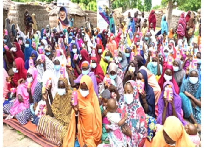
GBV/SRH frontline workers distributing liquid soap and hand sanitizers to women and girls in Custom house camp, Maiduguri, Borno State.