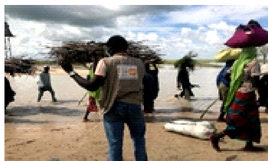
Assessment of flooding in the IDPs camp, Rann Kala Balge LGA, Borno State.