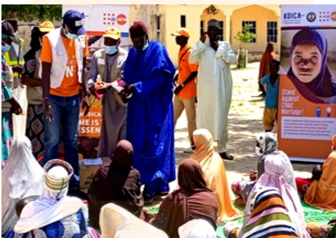
District head of Auno, during a flagging off ceremony for the distribution of liquid soap and hand sanitizers to 200 women and girls as part of measures taken against cholera epidemic in Auno community, Borno State.