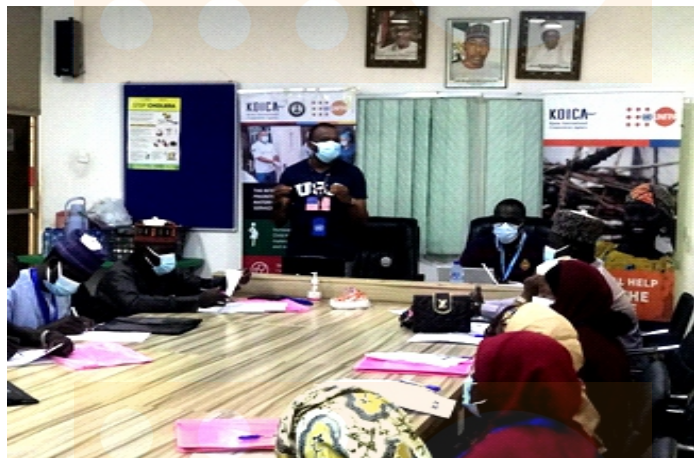
Participants during training on Cholera IPC, Environmental Cleaning and decontamination for UNFPA Nigeria Frontline Workers at Emergency Operation Centre (EOC) in Maiduguri Borno State.