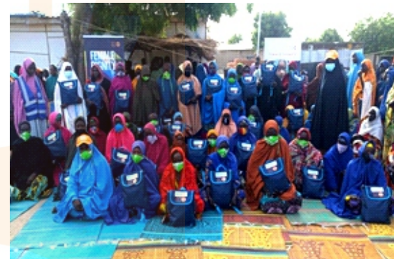
Women and Girls beneficiaries of dignity kits during Distribution in Dikwa, Kala/Balge, Monguno, and Dambo, Borno State.