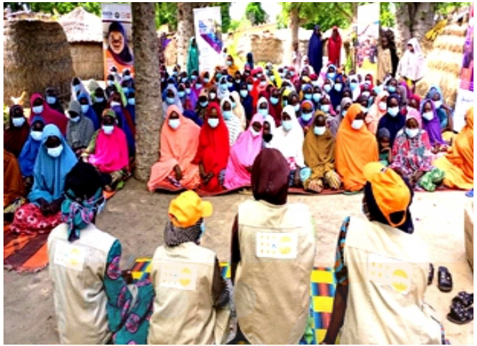
GBV/SRH frontline workers sensitizing women and girls on Cholera management, prevention and GBV/SRH key messages in Auno Community and Its Environs, Borno State.