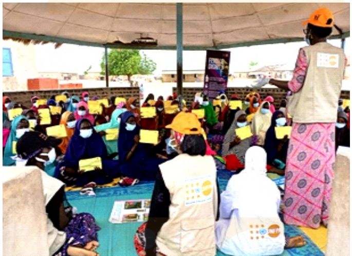
GBV/SRH frontline workers sensitizing women and girls on Cholera management, prevention and GBV/SRH key messages in Gubio camp, Borno State.