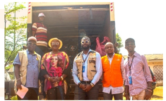
UNFPA staff members pose with the Honorable Commissioner of Women Affairs and Social Welfare, Awka, Anambra State after the official handover of the relief materials.