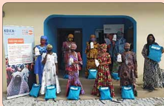
Cross-section photograph of Stakeholders and opinion leaders during presentation on the objectives of Spotlight Initiative on ending Violence against women and girls in Adamawa State