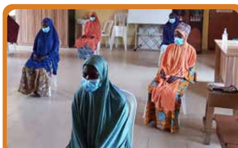
Sensitisation of Women and Girls at UNFPA Safe Space in Malkohi host Community on Prevention and Mitigation of COVID-19