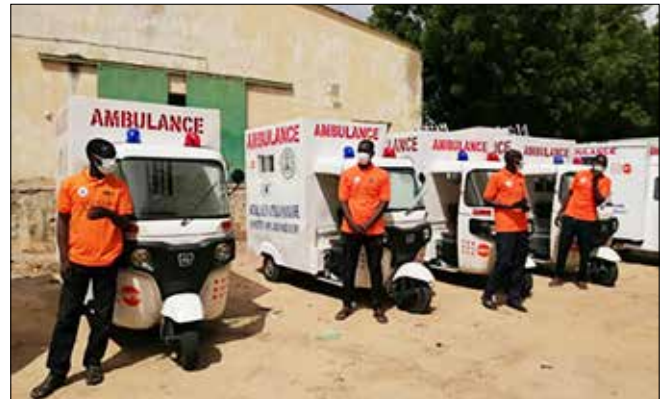
Mini ambulance and riders