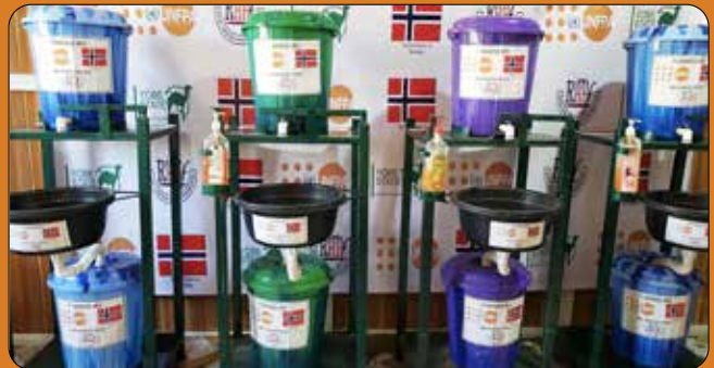
Hand Wash stations supplied to Yobe One Stop Centre for SRH & GBV at the General Hospital Potiskum, Yobe State