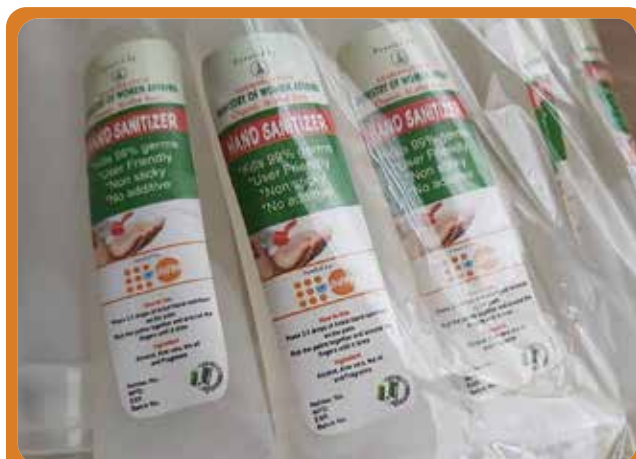
Hand sanitisers produced by the Adamawa State Ministry of Women Affairs with funding from UNFPA