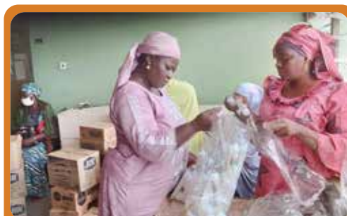
Hand sanitisers produced by the Adamawa State Ministry of Women Affairs with funding from UNFPA

In Nigeria, all 36 States and the Federal Capital territory, Abuja, have been affected by COVID-19. The Northeast BAY States (Borno, Adamawa and Yobe) are all affected by the COVID-19 pandemic with a total of 1,084 cases across the 3 States as at the end of the 3rd Quarter 2020.