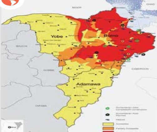
NORTHEAST STATES AFFECTED BY THE DISPLACEMENT CRISIS