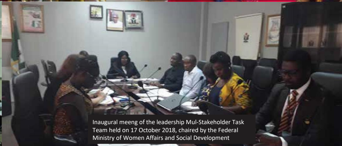
Inaugural meeting of the leadership Multi-Stakeholder Task Team held on 17 October 2018, chaired by the Federal Ministry of Women Affairs and Social Development