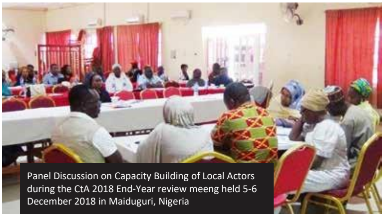
Panel Discussion on Capacity Building of Local Actors during the CtA 2018 End-Year review meeting held 5-6 December 2018 in Maiduguri, Nigeria