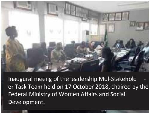
Inaugural meeting of the leadership Multi-Stakeholder Task Team held on 17 October 2018, chaired by the Federal Ministry of Women Affairs and Social Development.