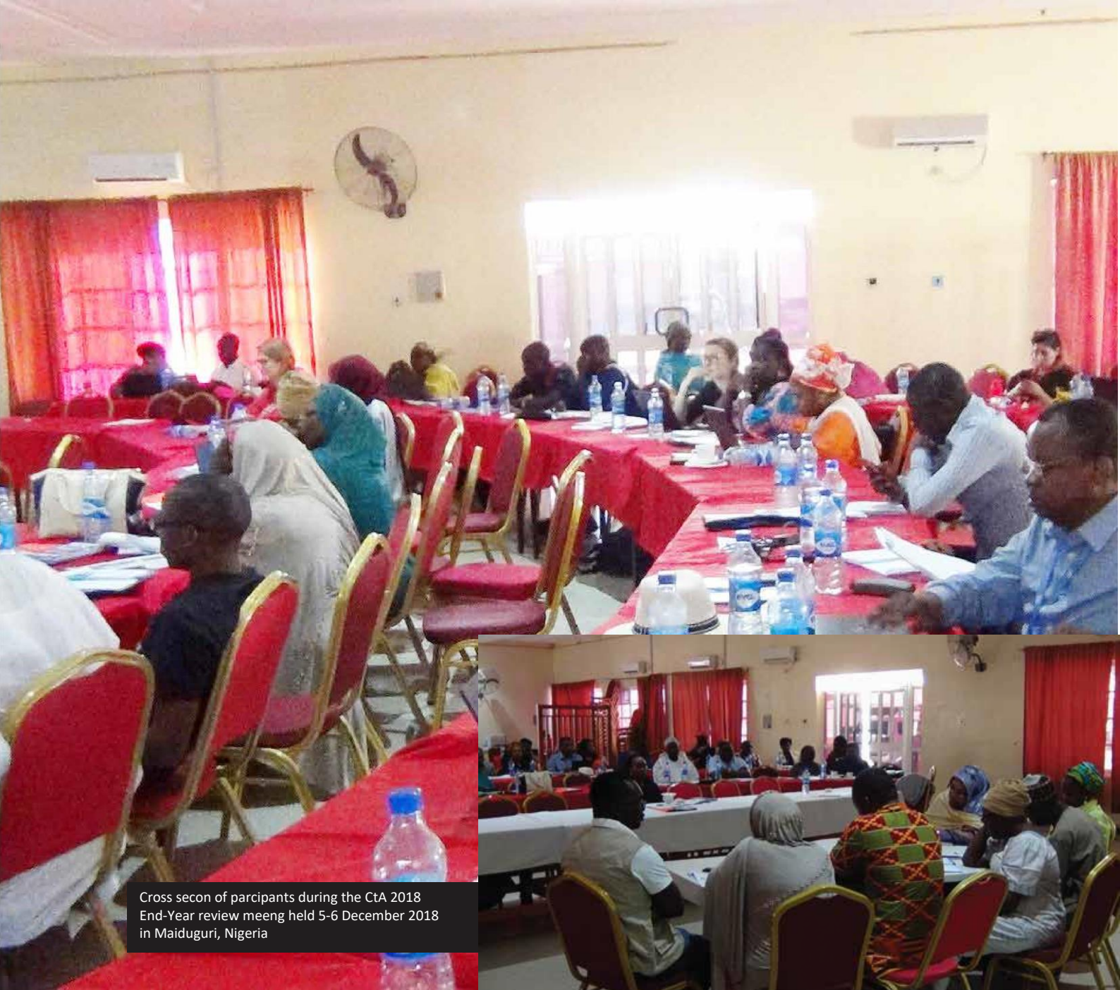
Cross section of participants during the CtA 2018 End-Year review meeting held 5-6 December 2018 in Maiduguri, Nigeria