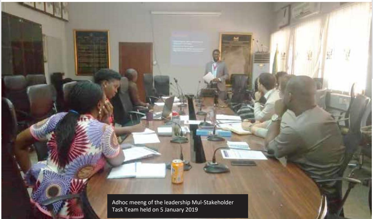
Adhoc meeting of the leadership Multi-Stakeholder Task Team held on 5 January 2019

A presentation of the CtA Northeast Nigeria road map was made at the meeting of INGOs Country Directors in Abuja on 30 October 2018. The Country Directors were called upon to play a significant role in providing guidance and support to their sub-office leaderships in Maiduguri to deliver on the commitments made in the Northeast Nigeria road map. This is also in keeping with their organization's broader commitment to the global Call to Action.