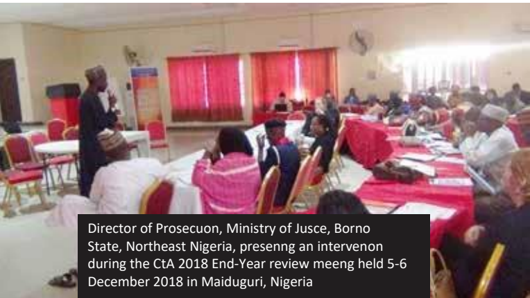
Director of Prosecution, Ministry of Justice, Borno State, Northeast Nigeria, presenting an intervention during the CtA 2018 End-Year review meeting held 5-6 December 2018 in Maiduguri, Nigeria