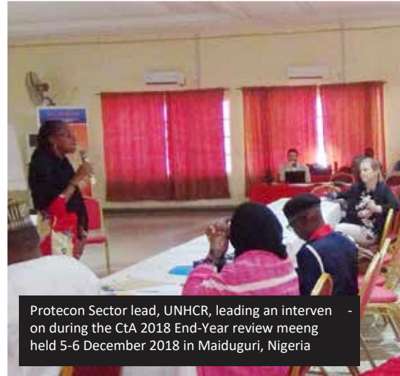
Protecon Sector lead, UNHCR, leading an intervention during the CtA 2018 End-Year review meeting held 5-6 December 2018 in Maiduguri, Nigeria