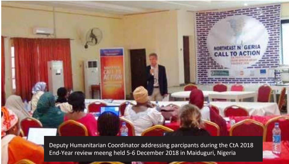
Deputy Humanitarian Coordinator addressing participants during the CtA 2018 End-Year review meeting held 5-6 December 2018 in Maiduguri, Nigeria